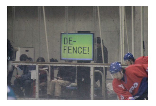
Figure 4. A 50 inch display at the rink side

remote audience can click buttons of "GO!", "NICE!", and "DE-FENCE!". "GO!" button is for encouraging a team, "NICE!" is for praising, and "DE-FENCE!" is used for cheering defending plays. Logs of button-pushing actions were stored in a database.