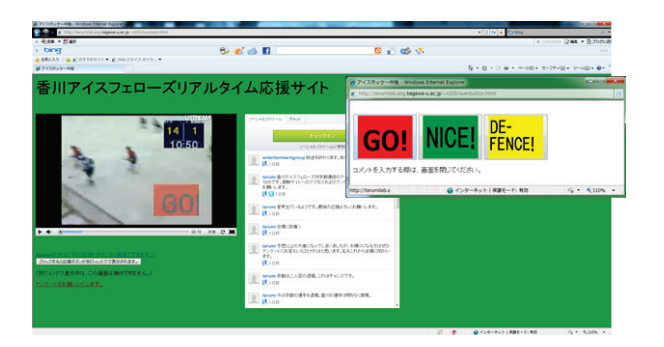
Figure 3. Cheering tool