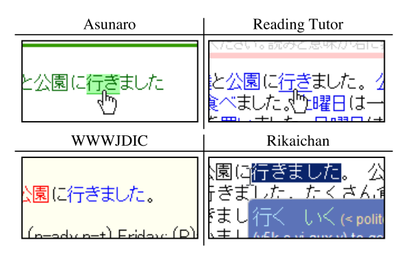
Fig. 2 An example of how word and gloss boundaries differ between reading assistant systems.