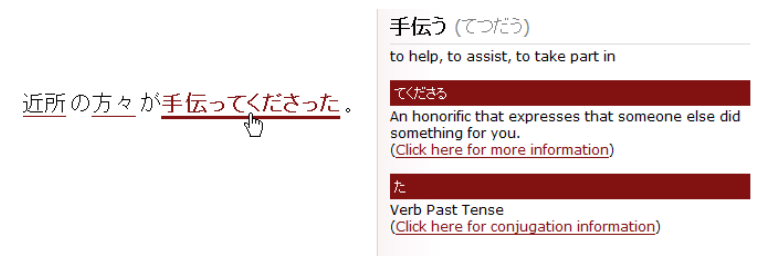
Fig. 10 An example of how a generated gloss is displayed in our system.