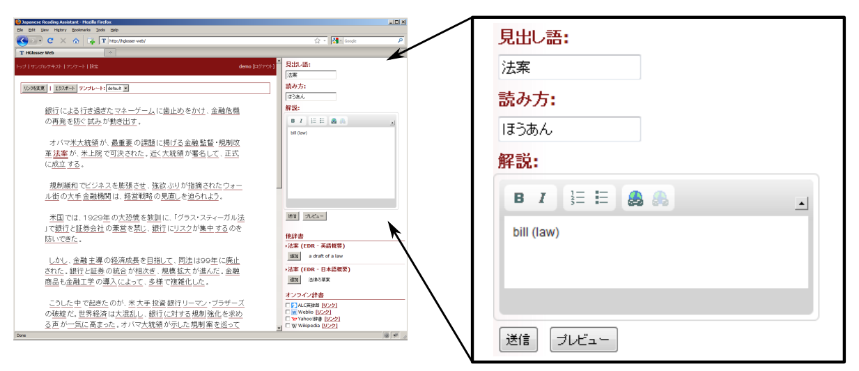
Fig. 11 The gloss editor in the system's web interface.