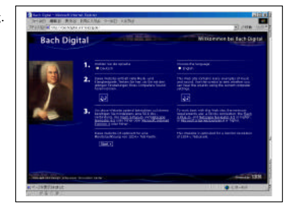
Figure8: Bach Digital http://bachdigital.uni-leipzig.de/

The Japanese musician in Paris answered about usability that home page of his information was only