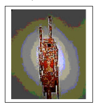
Figure 2: Art captured by a digital camera

evokes an atmosphere of ancient Africa and distant drums. Her aim was to make new art imaging comic image but as result she could provide emotion of anniversary.