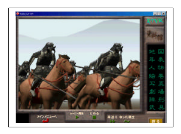
Figure6: War at Sekigahara 1600 in VR

The introduction in 1875 of western painting created a dramatic impression among the Japanese. The Japanese quickly mastered the western painting techniques, while foreigners such as Antonio Fantanesi (Italy, 1818-1882) created an environment for western paintings. The government began to finance young Japanese people's study of western painting in Europe. Within the framework of this earlier revolution, the author attempted to make a case study of digital art. At presentation and amusing in private time abroad (Berlin, Leipzig and London)