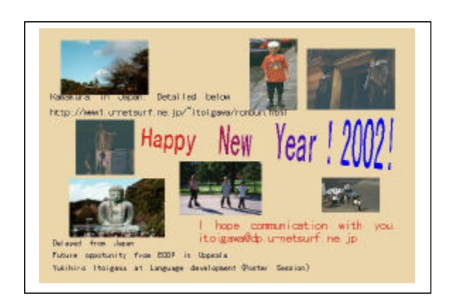
Figure4: New Year's greeting card from Japan http://www1.u-netsurf.ne.jp/~itoigawa/Happy2002.jpg

Analysis has led to the conclusion that there are some four steps involved in creating cards that embody a cultural statement. First is the conception of the message to be sent. Next is the gathering of materials for the visual collage. Third is the relation of a layout for the card. Last is the text or additional data to be attached to the card from the files.