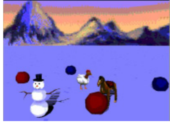
Figure 1: A screen shot of a prototype system

Figure 2 illustrates an overview of the system. The speech recognition module receives the user’s speech input and gives a sequence of words. The language understanding module analyzes the word sequence