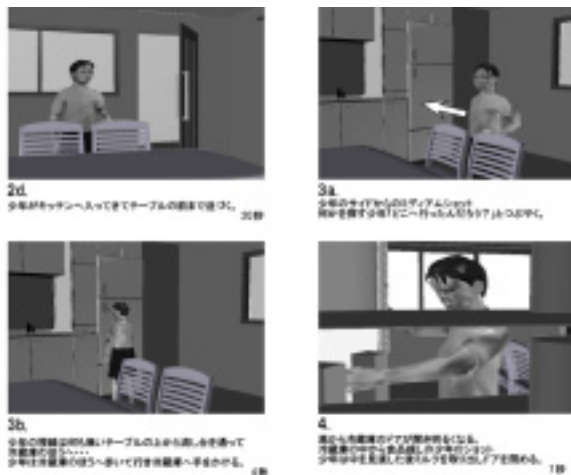
Figure 4: A fragment of the continuity for a scenario

The set of basic movements depends on the domain that the system deals with. In taking a bottom-up approach, we assumed a scenario in which two persons interact in a kitchen for a couple of minutes, and enumerated the verbs used to describe the scene. Figure 4 shows a fragment of the continuity for this scenario.