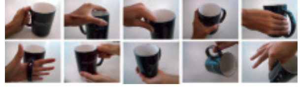
Figure 5: Classification of “grasp”

The second issue is the reusability of basic movements. As mentioned before, one of the advantages of a motion capture system is that it enables us to collect motion data easily. However, it is quite dif-