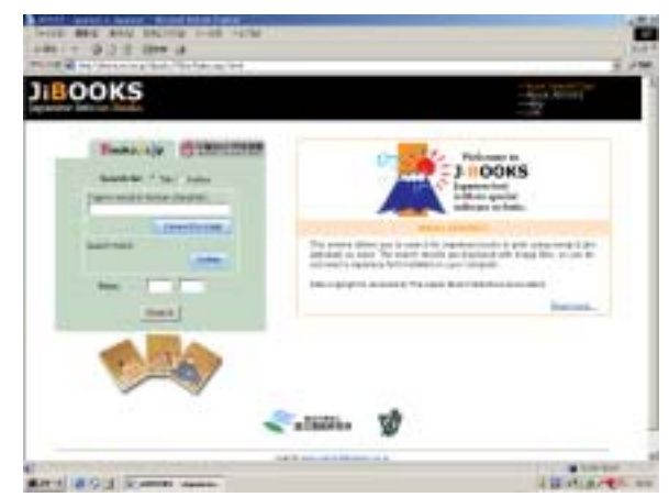
Figure 1. JiBOOKS top page

Web IME allows users to type in search terms in the Latin alphabet and convert them into kana and kanji characters. Because Web IME enables users to use kanji characters in their search terms, the target search words are better specified compared to the previous kana-only version, which produces more accurate results. For example, homophone words, such as 漱石 (name of the author Natsume Soseki) and 僧籍 (status of being a Buddhist priest) can be distinguished in the search activities, and orthographic variations found in romanization, such as Okuma / Ookuma / Oukuma / Ohkuma can be unified to 大隅.