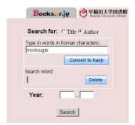
Figure 2. Web IME sample page 1