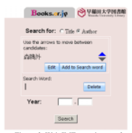
Figure 3. Web IME sample page 2