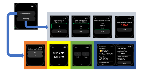
Figure 2: Application Flow Diagram

An experiment is conducted to collect feedback regarding implemented features, and results obtained suggest that the novel features may enhance user's motivation on exercising. Feedback about the application was obtained