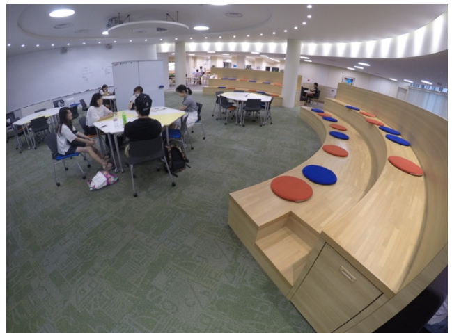
Fig. 7 Soka University Presentation Area in SPACe

Several Learning Commons integrate areas focused on presentation and lectures, smaller than the classical lecture halls, and with different purposes. They are usually open on the rest of the Learning Commons to incite people to freely attend the lecture or presentation that are organized. These presentation areas are less formal than a usual academic lecture, and open to a wider audience. In Japan especially, those presentations areas can be permanent, then using a mini lecture hall style of furnishing (Fig. 7).