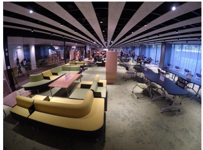
Fig. 5 Osaka International University Zoning in Learning Commons

In a larger integrated Learning Space such as a Learning Commons, the different types of spaces described above can and usually co-exist. Introducing the notion of zoning, in which different under categories of Learning Spaces, presenting different features for different kinds of practices, are existing in a single integrated structure, as functional units. In all territories, the zoning appears to be a key factor of the efficiency of a Learning Commons design, regardless of its size (Fig. 5).