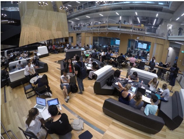
Fig. 6 University of Melbourne Group work areas in School of Design Learning Commons

As collaboration is a core component of any Learning Spaces design, Group Work areas constitute a key feature, especially in the Learning Commons. In all territories, bookable (though a classical human counter or through an online tool) spaces are very popular among students. They are usually equipped with collaborative tables, shareable screens and writable surfaces. Physically, they can be closed (usually by glass walls) or separated by specific furniture (Fig. 6)