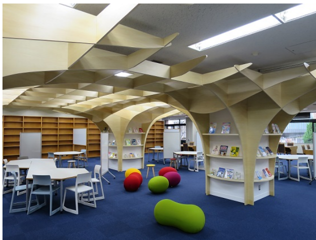
Fig. 1 Kyoto University Central Library Learning Commons

Although the first attempts of such Learning Spaces mainly consisted to Active Learning Classrooms, the trend then moved to larger and integrated spaces as the Learning Commons (Fig. 1) or the Learning Centers, most of them considered to be a new generation of University Libraries as they usually are located inside them or replacing them.