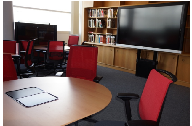
Fig. 2 Paris Ile-de-France Digital University BYOD Faculty Development Active Learning Classroom In Paris 8 University library

The second type of layout and furnishing is based on fixed tables, usually designed to promote collaboration by proposing a design that allows all the participants of a group to see each other, and by providing specific features such as wired networking for specific purposes, power supply, and shareable displays (Fig. 2).