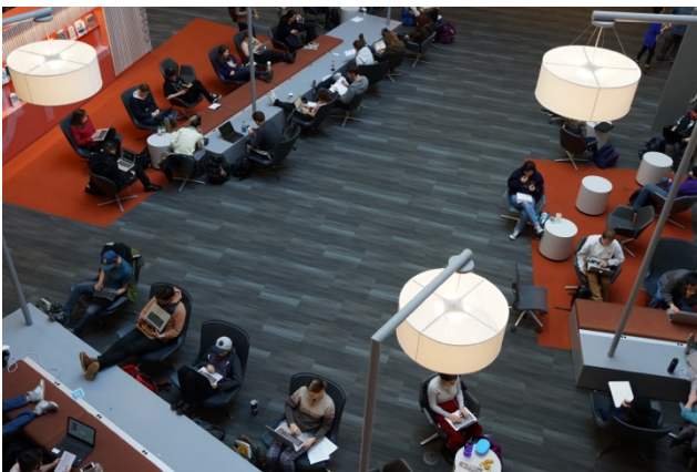
Fig. 4 University of Washington Informal Spaces in Odegaard Library 1F

Those informal areas are especially compliant with the BYOD. That's the reason why the type of furniture chosen for such areas are not only comfortable, but also integrate power plugs for many of them (Fig. 4)