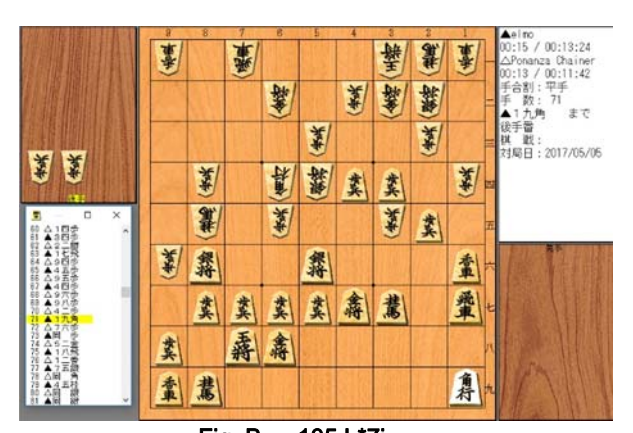
Fig. B 105.L*7i

Human players usually make a mistake around this move, but elmo played correctly and won (see the game record above).