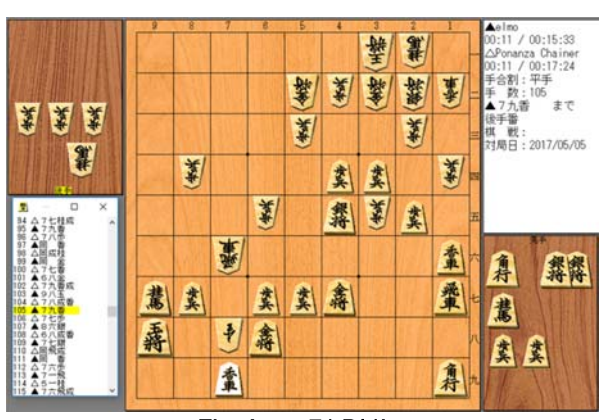
Fig. A 71.B*1i Almost all viewers, including the commentators, were surprised.

185.L1ex1d 186.+B9f-6c 187.L1dx1b+ 188.+B6cx4e 189.G*2b 190.G3bx2b 191.+L1bx2b 192.K3ax2b 193.S*2c 194.K2b-1c 195.G*1d resigns