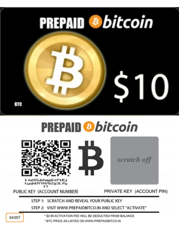
Fig. 2 Example of a Prepaid Bitcoin card [25].

For the third assumption: this is difficult to implement until Bitcoin becomes a widely accepted currency. In general, users can obtain BTC through Bitcoin ATMs, online and offline exchanges, accepting BTC as payment, by buying from friends, and through mining. In the proposed system, it is ideal that the administrator (or government) provides all necessary Bitcoin expenses, so that the voters do not need to spend any money. However, a voter cannot reveal the Bitcoin address that he/she will use for voting to any other entity without compromising his/her anonymity and privacy. The most viable option is for the administrator to provide Prepaid Bitcoin cards (PBCs) [25] to all eligible voters. PBCs are physical or virtual cards that are pre-loaded with BTC. A PBC contains a public Bitcoin address with a pre-loaded amount of BTC and the corresponding private key, which is covered and can be scratched off, as shown in Fig. 2. The PBCs that will be used for the proposed e-voting system can be created by a third-party or by the administrator itself.