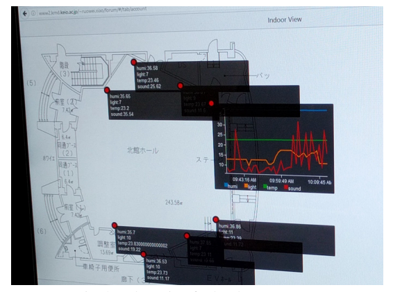
Fig. 4: Indoor view for local sensor group