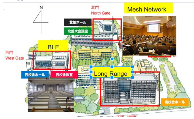
Fig. 3: Experiment Layouts in Keio University Mita Campus

For location information, the platform intends to separate indoor location and outdoor location. Outdoor location can be traced based on network or GPS. The indoor location could be preset with specific sensor identification. At the current stage of implementation, the location information process was done on the application side.