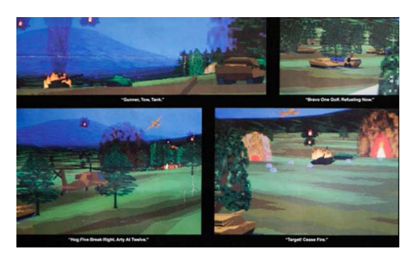
Fig. 1 Images showing early implementations of SIMNET.

at hand with less effort. As such, the goals of augmented reality have traditionally been task driven. One objective of the ultimate augmented reality system would be show the most relevant information at the most appropriate time and place. Another type of ultimate augmented reality system would add virtual content onto the real world or modify existing objects in a way that is indistinguishable to the user. As mentioned above, this basic idea was presented and demonstrated by Sutherland in the1960s. Somewhat later, Caudell and Mizell coined the term 'augmented reality' in 1992 for the HMD-based system they developed for wire bundle assembly at Boeing [12]. Released in 1999, the markerbased open source tracking library, ARToolKit, further facilitated the acceleration and dissemination of augmented reality [29]. In the late 2000s, augmented reality was made known to general public through the entertainment industry using games such as The Eye of Judgement in 2007, which is thought to be the first AR consumer game, and the Nintendo 3DS in 2011. To date, Pokemon Go alone has acquired more than 200 million players and earns more than $2M everyday worldwide. According to Digi-Capital, the augmented reality market as a whole is expected to grow to $90B by 2020.