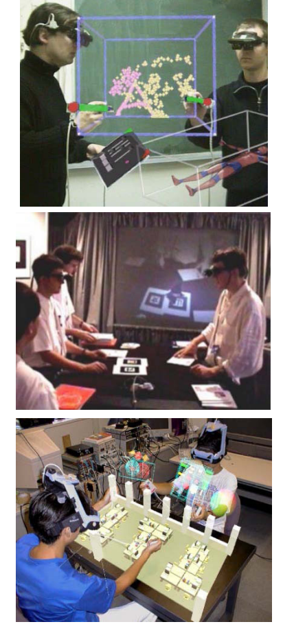
Fig. 2 Typical early collaborative AR systems. (top) Studierstube, (middle) Shared Space, (bottom) SeamlessDesign [31].

In addition to standalone virtual technologies, early examples