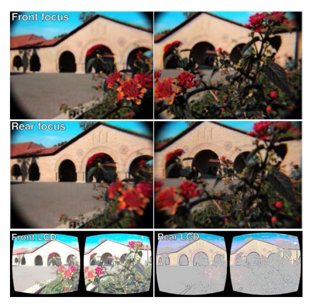
Fig. 4 Images of a Light-Field Stereoscope, showing resulting front and rear focus (top and middle rows, respectively), and the images rendered on the front and rear LCD to generate this multi-focal possibility.

28,800 color triads or approximately 207.8 \times 138.6 color pixels. The refresh rate was 30 Hz (it often dropped below 10 Hz due to low graphics power), and with 24 bits/pixel for stereo rendering, the uncompressed data rate was about 39.6 Mbps, or 2 Mbps in H.264 format. Modern HMDs have much higher resolution and refresh rates. For example, the resolution of Oculus Rift CV1 is 1080 \times 1200 (1,296,000) per eye driven at 90 Hz resulting in an uncompressed data rate of about 5.3 Gbps, 135 times more than that of EyePhone. Even with H.264 format, this is around 250 Mbps, which would only be transmissible while mobile via the 5G network. Next generation technologies like light field and holographic displays reproduce more realistic 3D images with accommodation cues, and they demand even higher bandwidths. For example, light field displays with micro lens arrays typically require about 10 \times 10 (100 times) the number of pixels compared to conventional binocular stereo displays. To achieve similar angular resolution, bandwidth of a few hundred Gbps is required. Though still bandwidth intensive, factored light field synthesis via stacked LCD panels, as shown in Fig. 4 [22], require less data to produce the same resolution, which makes it a promising technology in the era of the 5G high speed network.