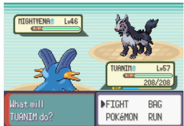
Fig. 1: A screenshot of Pokemon Emerald

So, we focus on Pokemon battle which is the core part of of