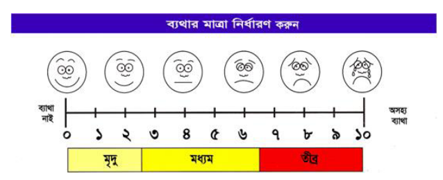
Fig. 2 Visual Analog Scale (VAS) in the local language Bangla used for training. For each of the pain intensity levels indicated on the line, the image of the face represents possible expression in the face. 0 means no pain and 10 (far right) indicates the highest possible level of pain.

patients were considered for these pilot study. So 14 women was recruited for these data collection system. Since the data collection technique is pretty new in the rural area all the patent as well as the attendant were trained how to take the pictures using the camera at the health center. The additional features of the mobile app were also shown afterwards.