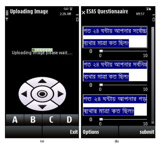
Fig. 1 Two screen shots of mobile application for labeling and uploading pain image. (a) shows image uploading status. (b) shows labeling of pain intensity using a sliding bar in the local language Bangla.