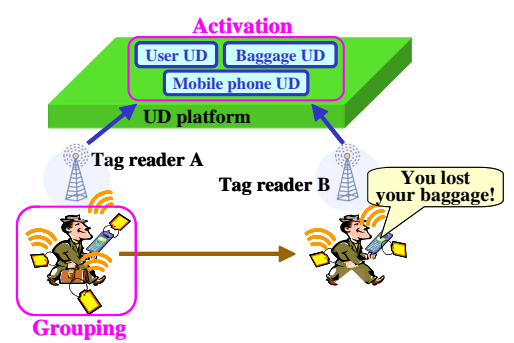
Fig. 3 Example of tag-grouping.

detects multiple tags, multiple UDs can be activated by grouping these tags simultaneously. We call grouping multiple tags, "tag-grouping." The activated UDs determine the effective service by coordinating[2][3].