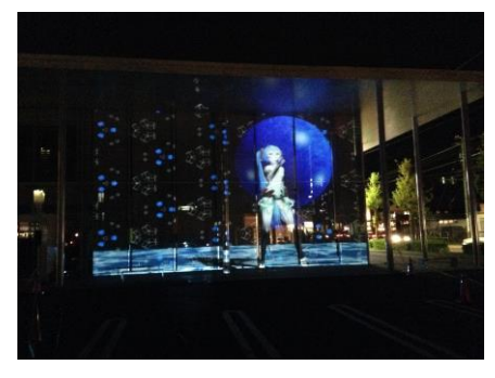
Fig.1 Pictures show the projection mapping events Koudaisai 2014 [11] and Koudaisai 2015 [12], in the annual festival of Kanazawa Institute of Technology.