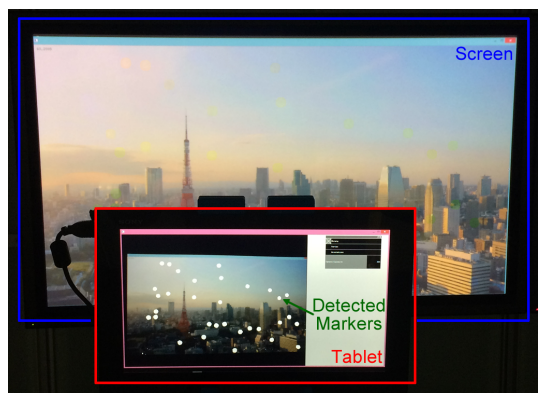
Fig. 3 Client application showing the dot pattern overlaid on the camera image.

Figure 4 shows the result of embedding a dot marker in a picture of Tokyo. At the remote display, no dots can be seeing, because we are switching the images with the dots in complementary colors in a frequency faster than the human eye can perceive. On the tablet display, we highlighted the dot pattern for illustration purposes. As the light from the environment and the brightness from the remote display can