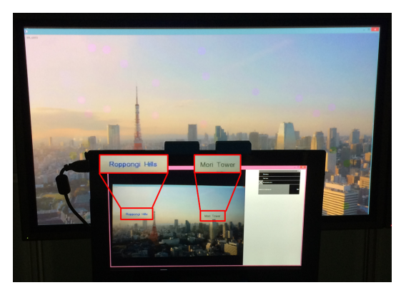
Fig. 4 Example: annotations based in context.

affect the detection of the pattern, we created a slider to control the camera exposure manually.