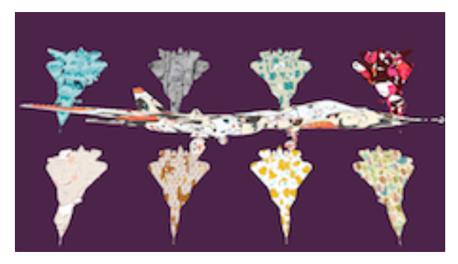
Fig. 2 Screenshot of demo application

In our modification, which is represented in Fig. 3 , we created a Mesh class based on OpenGL library that can load the object file of the jet-fighter. This object file, which ends with .obj, is created by using Blender, a professional OSS for 3D computer graphics. Generally, this object file stores all the vertices to construct the object, which is the jet-fighter in our current implementation. By loading the object file into the VertexArray of OpenGL, client's graphic card render the object based on a pre-specified OpenGL context. After SDL_RenderPresent has shown the contents from video-streaming, we swapped the SDL rendering context into OpenGL context by using SDL_GL_MakeCurrent. Finally, we used SDL_GL_SwapWindow to display the rendered jet-fighter upon the contents from video streaming.