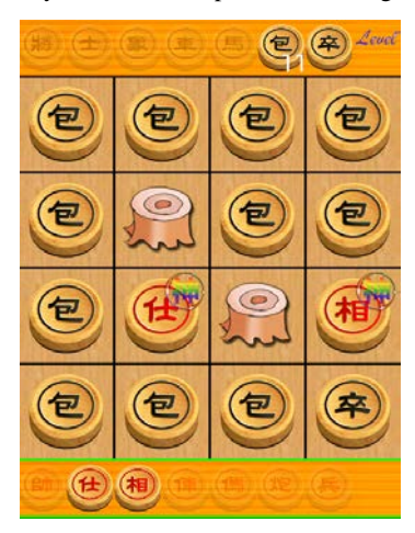
Figure 6. A many-cannons example. The winning rate is almost 0.