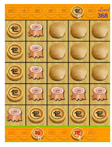
Figure 4. An example with many cannons. The winning rate is 0.15.