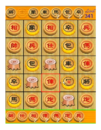
Figure 3. An example of all NPC's pieces are protected by Gold magic. The winning rate is 0.1.

As mansions in section 2, the rule of cannon is different to other pieces. In fact, the cannon is a special piece. There is no similar kind of piece in western chess and Shogi. In Magic Chess, many interesting initial board are made by adding cannons. Figure 4-7 are examples.