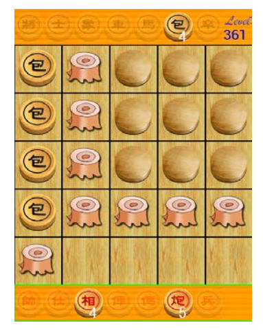
Figure 5. A many-cannons example. The winning rate is 0.65.