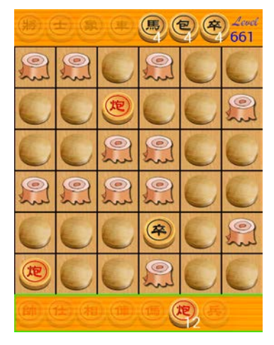
Figure 2. 6x6 Magic Chess.