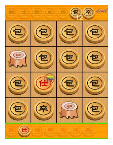
Figure 7. A many-cannons example. The winning rate is 0.05.