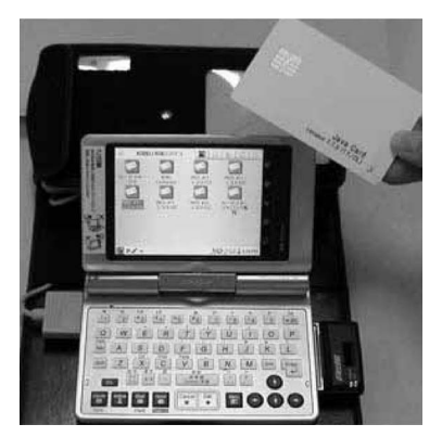
Fig. 1 Picture of prototype system.

We implemented the self-delegation and authentication protocols on a PDA and a Java card, both of which have ISO/IEC 14443 I/F<sup>4)</sup>. A picture of the prototype system is shown in Fig. 1 , and the structure of the self-delegation application is shown in Fig. 2 . We also implemented cryptographic library and ISO 14443