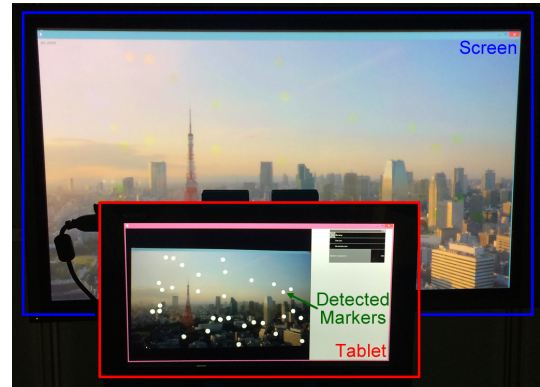
Fig. 3 Client application showing the dot pattern overlaid on the camera image.

client applications and pattern generators (which run on the displays). Once the marker is detected and the projection matrix is computed, this is sent back to the client application, for rendering an augmented content in the correct position. In this our case, we show some annotation regarding the image that is displayed on the screen.