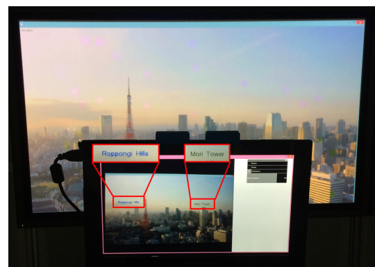
Fig. 4 Example: annotations based in context.

Figure 4 shows the result of embedding a dot marker in a picture of Tokyo. At the remote display, no dots can be seeing, because we are switching the images with the dots in complementary colors in a frequency faster than the human eye can perceive. On the tablet display, we highlighted the dot pattern for illustration purposes. As the light from the environment and the brightness from the remote display can